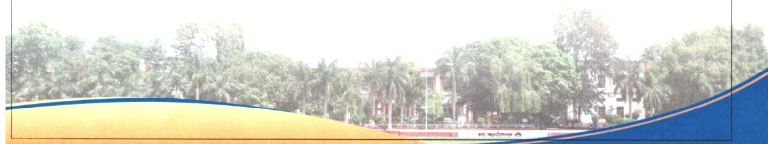
PRINCIPAL S.G.G.S. KHALSA COLLEGE MAHILPUR (Hoshiarpur)