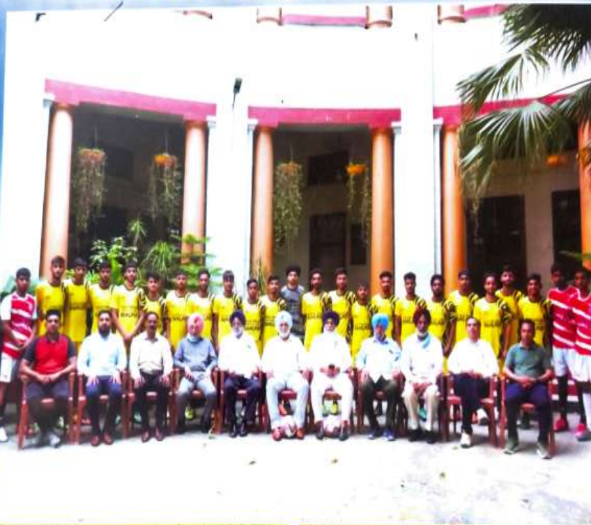
Silver Medal in Punjab State Super League Tier-2, 2020-21