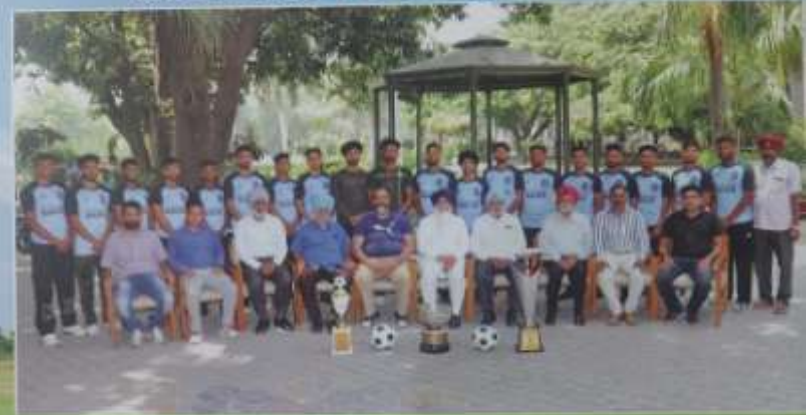
Gold Medal in Punjab University Inter College Football Championship (Division A) - 2021-22