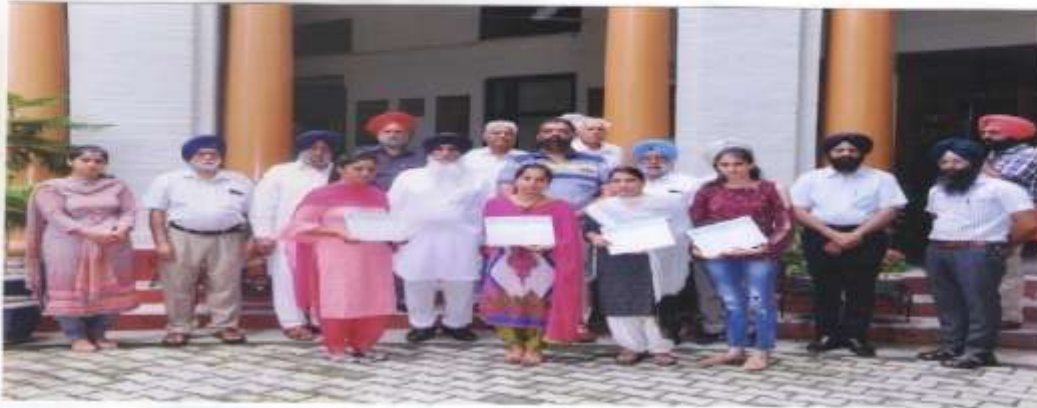
CERTIFICATES DELIVERED TO CANDIDATES OF OUR WORKSHOP APRIL 2019 BY COLLEGE MANAGEMENT COMMITTEE