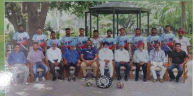
Gold Medal in Punjab University Inter College Volleyball Championship (Division A) - 2021-22